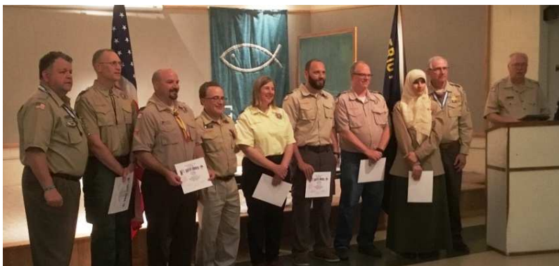
Patriot Spirit Award Recipients