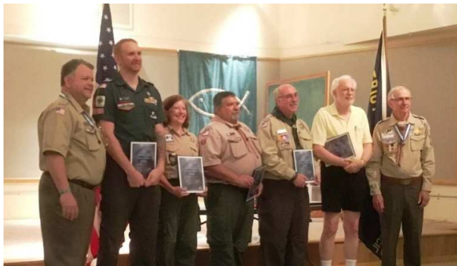
Distinguished Patriot Scouter Award Recipients