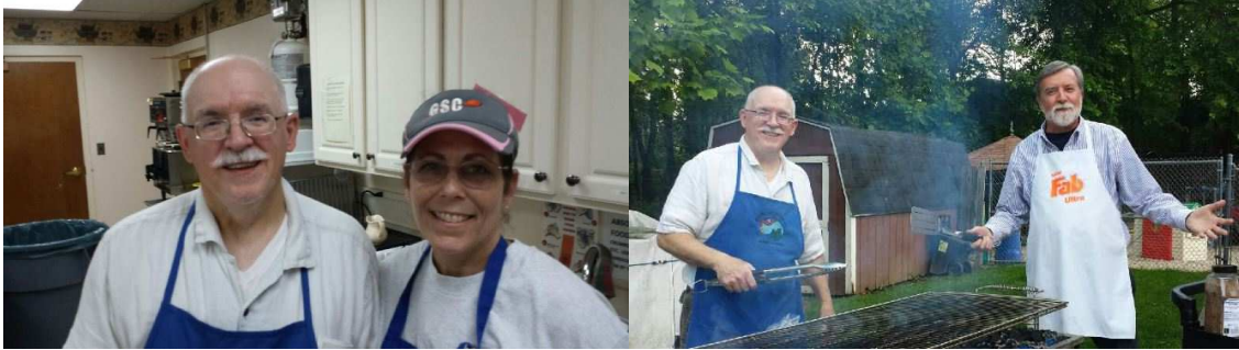
Kitchen Crew and Grill Masters at Work

Thanks to everyone who helped to make this 18 th Patriot District Annual Recognition event a great success, including everyone who pitched in at the end of the evening to efficiently complete cleanup duties.