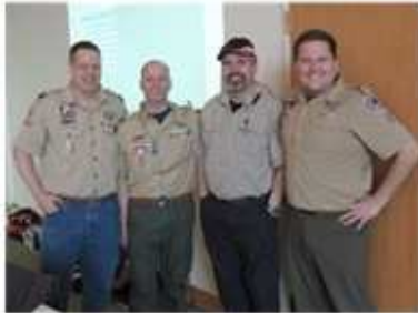
PWD Volunteers Ready for the Big Day