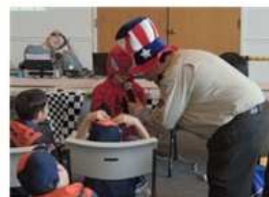
And a Cub Spider, too!