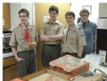
Scout Volunteers Taking A Pizza Break