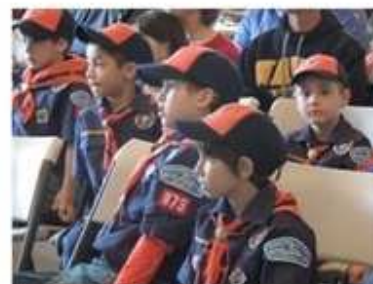
Tiger Cubs Enjoying the Racing Action