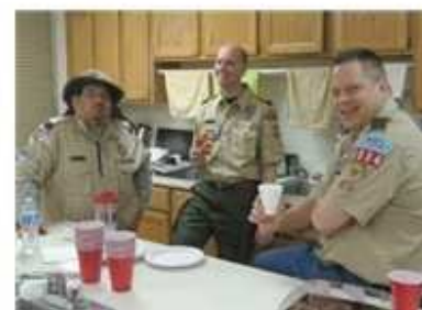
Adult Volunteers Need a Break, Too.