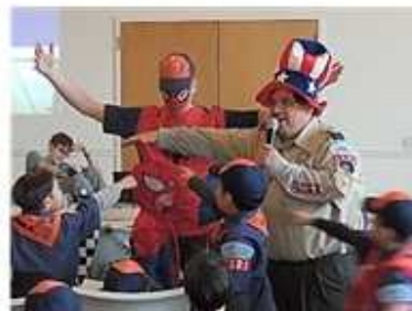
Surprise PWD Appearance by Spider Man