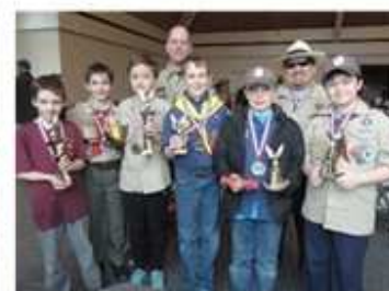
Arrow of Light

For the speed competition, each car category raced once in each of three lanes and the lowest average times were used to determine first, second, and third place winners for each of the five Dens. As is the case each year, times were amazingly close! Racers in the Webelos Den witnessed one outcome that was separated by only