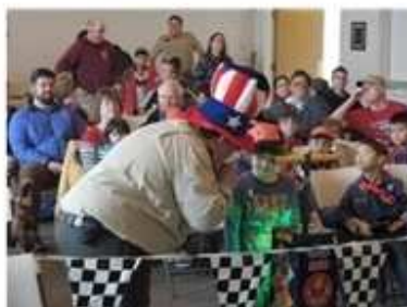
Getting Ready to Blast Away for the Next Race