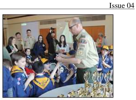
Medals for All