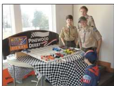
Show Car Judges