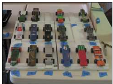
Cars Ready to Race