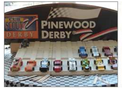
Show Car Display