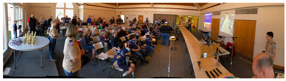
PWD 2018: The Largest Such Event in the Last Eight Years

The annual Patriot District Pinewood Derby – the Super Bowl of Cub Scouting – was held on Saturday, March 10, at Living Savior Lutheran Church in Fairfax Station. The event was once again a smashing success. with 157 Cub Scouts from 18 District Packs competing. From the smiles and sheer volume of raucous laughter, clapping, and Scouting-mayhem, it was evident that everyone, from the youngest Cub Scout to the most, um, "seasoned" Scout leaders and adults, had a fabulous time. Cub Scouts competed in either Speed or Show categories within their respective Den groups: Tigers, Wolves, Bears, Webelos, and Arrow of Light. Participating Cub Scouts personified good sportsmanship throughout the day, and it was truly inspiring to see these young future leaders act in such a mature and honorable way. Joining the competitors were highly energized parents, siblings, and friends who arrived in waves as the day progressed to share in the fun and cheer on their Cub Scouts.