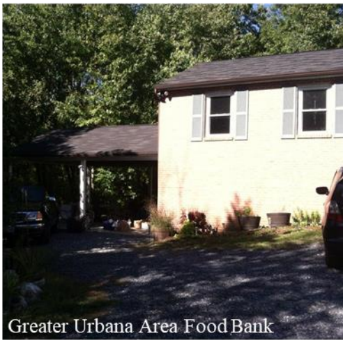
Greater Urbana Area Food Bank

The Summit Award requires a Summit Project (just like the Boy Scout Eagle) and I am honored to announce that the Greater Urbana Area Food Bank has asked me to build a walk-in cooler for their property. The Greater Urbana Area Food Bank supplies around 220 families with food on a regular basis and some of this food requires refrigeration (e.g. eggs, meats, cheese, and turkeys during the holidays). My Summit Project seeks to provide a space where perishables can be stored and preserved.