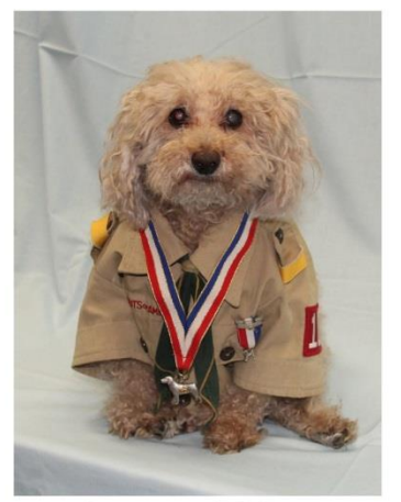
CHEVY SCOUT Troop 100 Beagle Scout 2016

Brook Hill United Methodist Church in Frederick, Maryland will be offering all four of the Protestant faith Religious Emblems courses in February 2018. For more information on these courses, please select the course that corresponds with the Scout's current grade in school (using the link below). The registration deadline is January 27, 2018. Francis Scott Key Religious Emblems Program.pdf